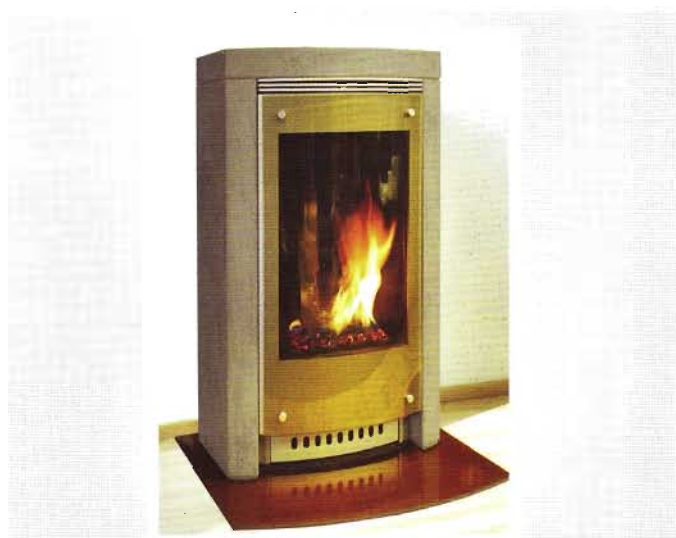
VRTIKL shown with cast stone surround, rear vent conversion kit and optional rectangular-shaped hearth pad.

Cover photo: VRTIKL shown with bronze curved outer glass and matching optional hearth pad. Top photo shown with grey curved outer glass, matching optional hearth pad and optional rear vent kit.